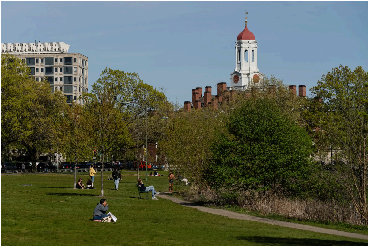
The Harvard campus in Cambridge, Mass. One instructor there said he had integrated a custom chatbot into a computer programming class.