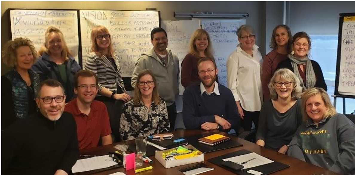
AALHE Board of Directors Retreat, November, 2019