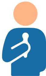
Photo Booth at Opening Reception | $2,500

Join us at the Opening Reception on Tuesday night where your company will be provided with a three-minute window to present during the welcoming remarks. In addition to your presentation, you will be the drink sponsor for the event. Each attendee will receive one of your customizable drink tickets that will be inserted into the attendee lanyard holder for the event.